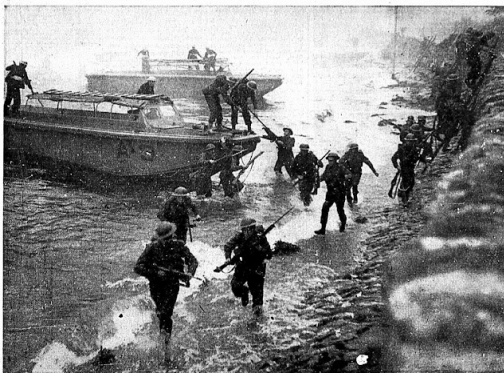
HOW THEY LANDED: Along the broad stretches of open beach around the French coast town of Dieppe Canadian Commandos have landed under fire to blast German-maned defenses there. The landing operation at dawn today must have appeared similar to the landing practice pictured above. In the photograph, however, the landing is being made by men rehearsing invasion assault in the Scottish Command in Britain.

19 Aug 1942: 50 U.S. Rangers participate on the Canadian raid at Dieppe, France. Over 6,000 casualties (killed, wounded and captured) to include 3 U.S. Rangers killed, 5 wounded and 3 captured.