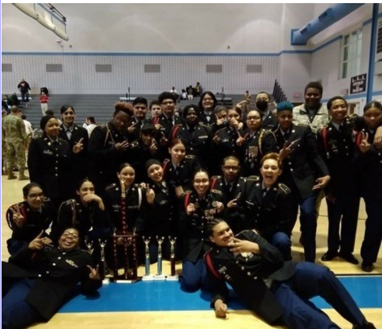
Well done East High School JROTC Cadets