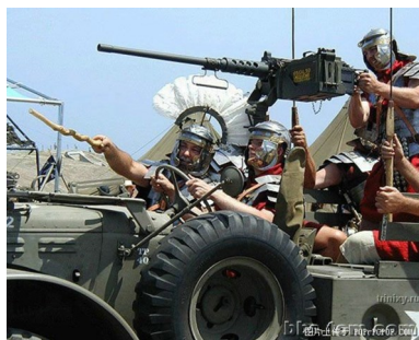
Centurion Glutealius Maximus directs the advance reconnaissance element of the Cohort I, Legion VI (Ferrata).

We mark the 2,073 anniversary of the Battle or Siege of Alesia in present day France. The battle was fought by the Roman army of Julius Caesar against a confederation of Gallic tribes united under the leadership of Vercingetorix of the Arverni. It was the last major engagement between Romans and Gauls, and is considered one of Caesar's greatest military achievements resulting in a resounding victory. Commenting on the battle, Caesar reportedly said, "they had Gaul, but we had superior mobility and firepower."