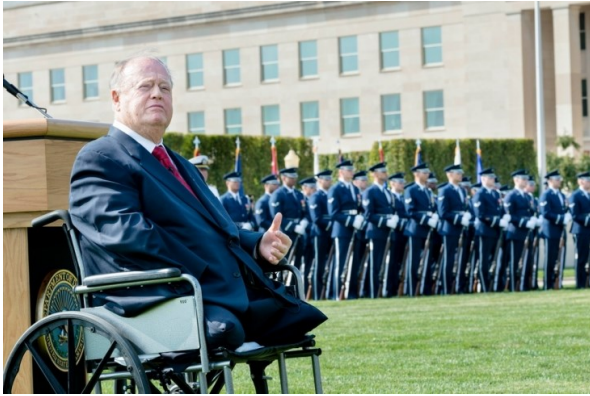
Max Cleland. ARLINGTON, VA, UNITED STATES. 09.19.2014.