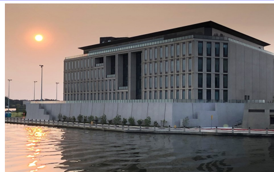
Another view of Hoper Hall