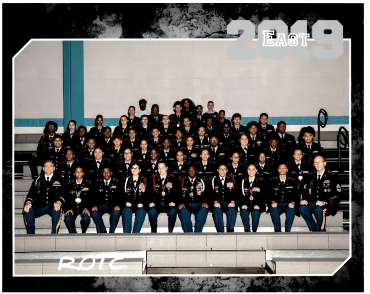
East High School Army JROTC Group Photo, 2019.