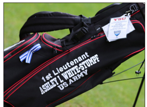
YSU Women's Golf Team Folds of Honor Bag