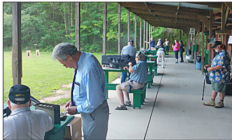
Range Prep and Safety Instructions