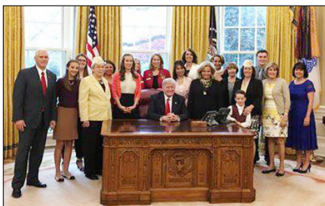
At the White House Gold Star Wives met Vice President Pence and Mrs. Pence. They got to speak with his staff about the SBP-DIC Offset! Then they met President Trump!