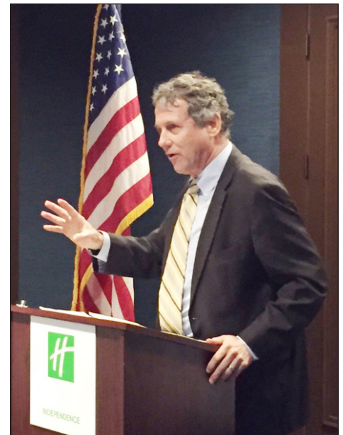
Senator Sherrod Brown was the speaker at Cleveland Chapter in March.

He did take questions from those in attendance; one was on the Affordable Health Care Act (before the vote). Several Reservists asked why their benefits were being reduced. Brown's aides took note of those issues and assured that they would provide a reply. Several members of Senator Brown's staff are veterans.