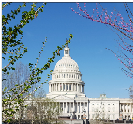
A beautiful day to "Storm the Hill"