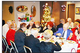
The festive atmosphere at The Manor in Austintown for the ROA/MOAA Christmas Party