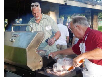
You were cooks in the military, right?