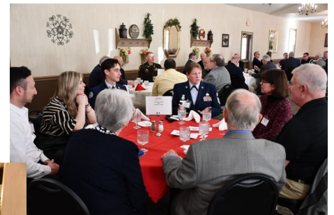
JROTC parents, cadre and MSVC members