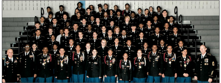
East High School Army JROTC