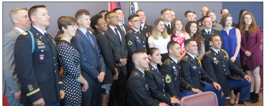
Youngstown State University Army ROTC