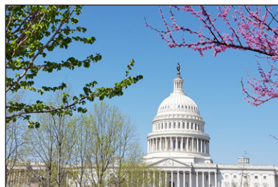
Dick Calta took this photo on the day MOAA Stormed the Hill