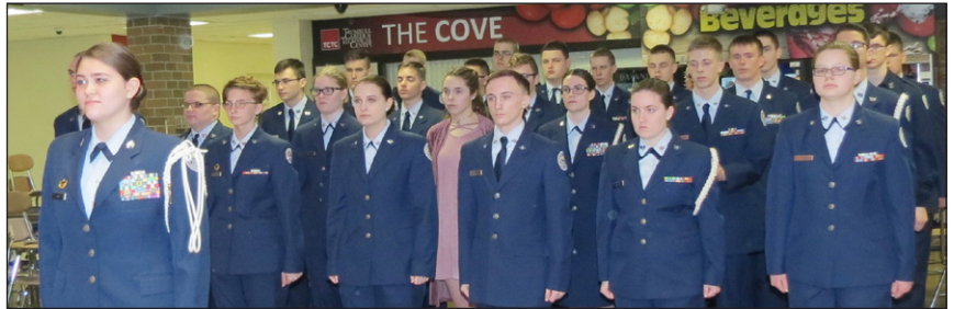
Trumbull Career and Technical Center Air Force JROTC